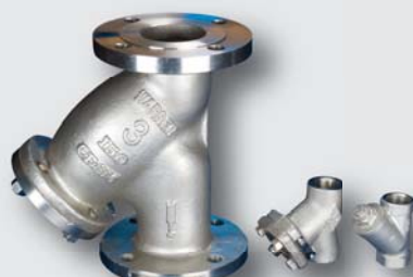
#7156, 7806, 227