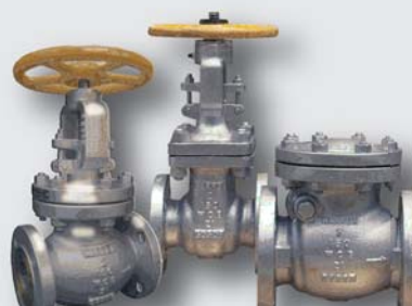
#1155, 2155, 3155