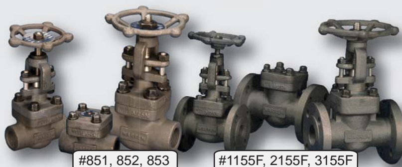
#851, 852, 853