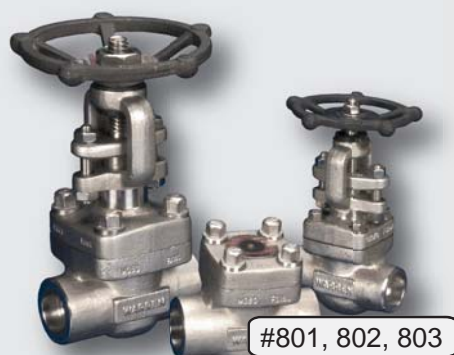
#801, 802, 803