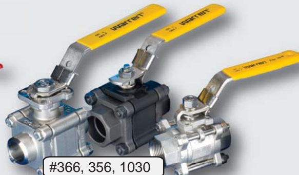
#366, 356, 1030