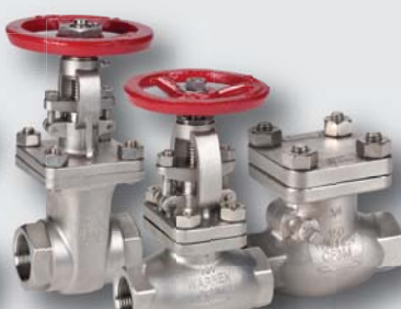
#1156-T, 2156-T, 3156-T