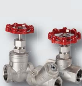
#221, 222, 223