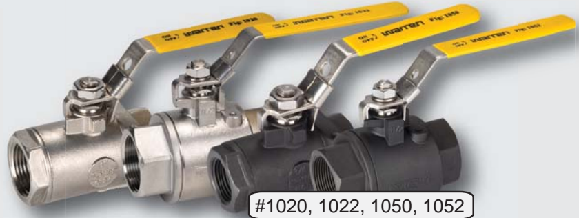
#1020, 1022, 1050, 1052